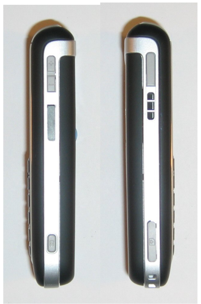
Right and left view