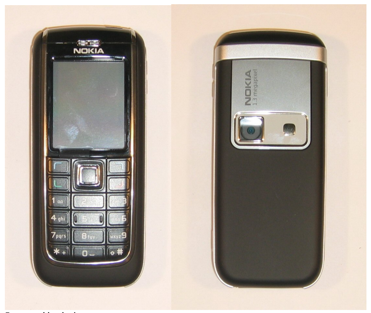
Front and back view