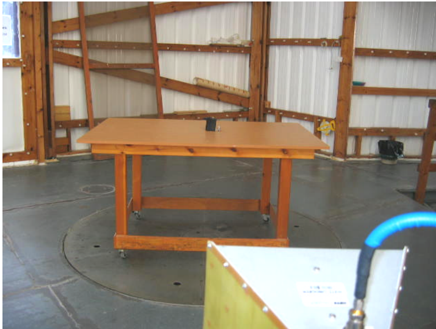
Photograph No.1 Output power, field strength and the 6 dB occupied bandwidth measurement setup