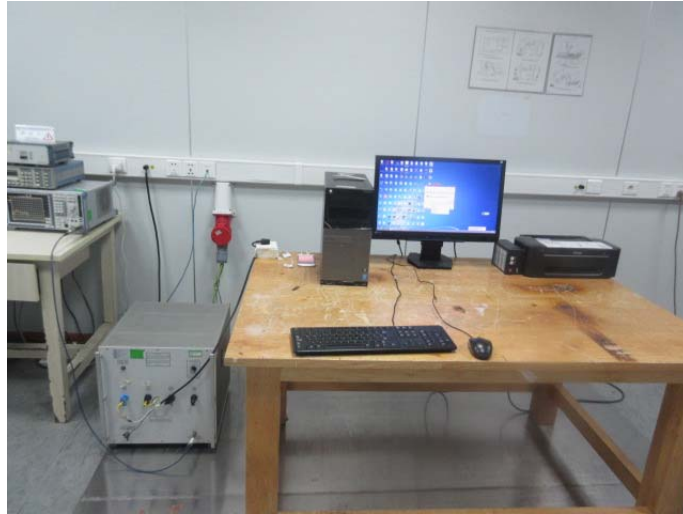
Radiated Emission (30MHz-1GHz) Connect to PC