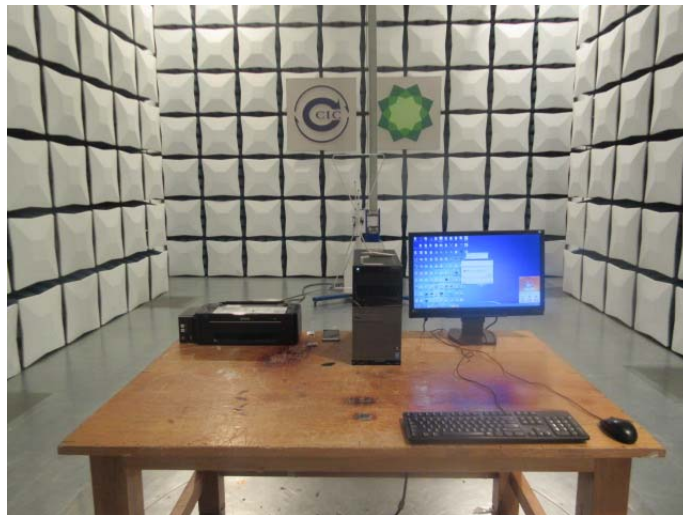
Radiated Emission (above 1GHz) Connect to PC