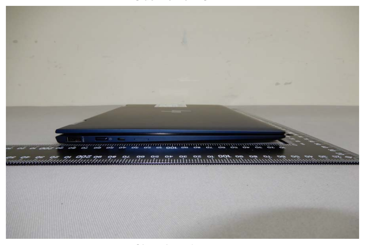
Side View of EUT - 3