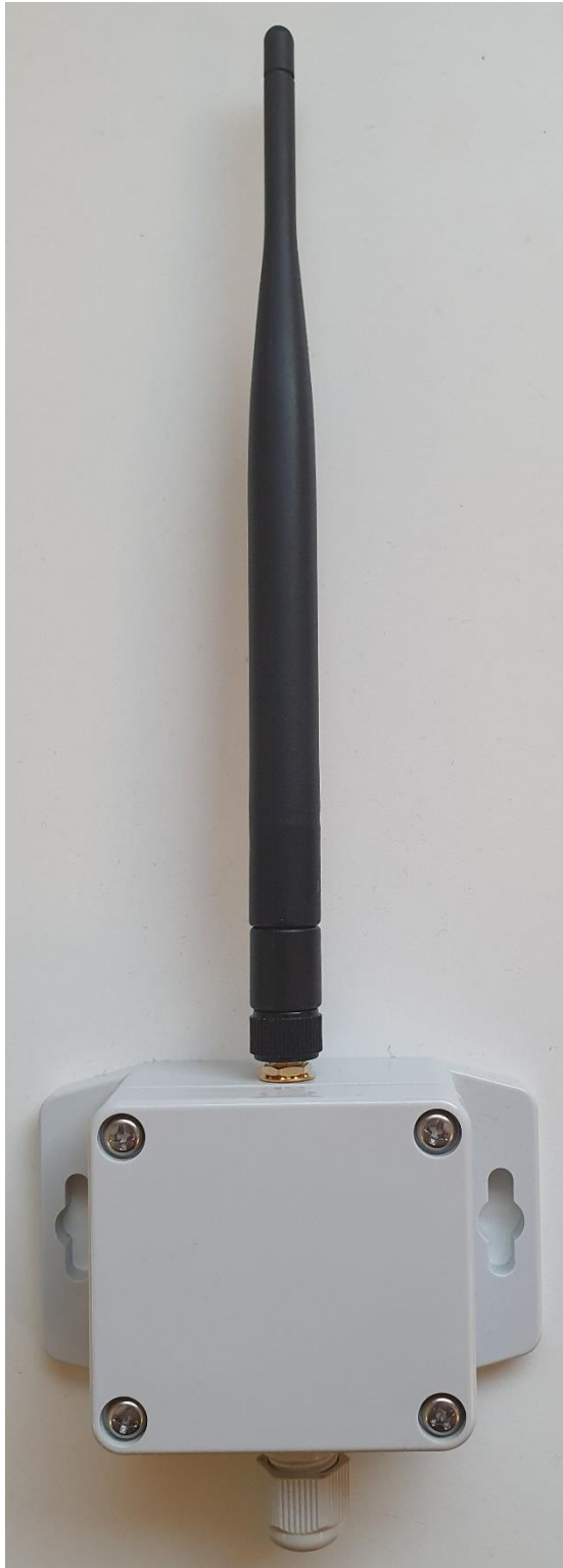
ELT series with antenna