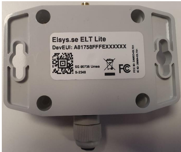
ELT lite bottom, label location