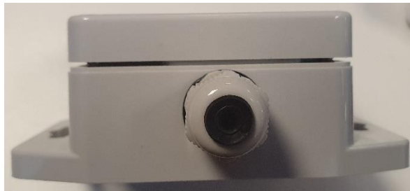
ELT lite back