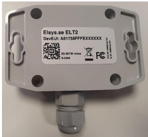
ELT 2 bottom, label location