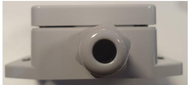
ELT 2 back