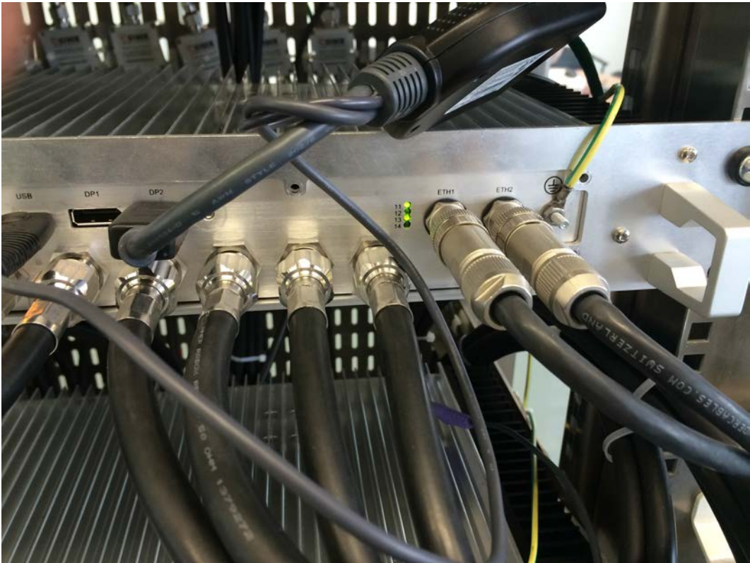
Figure 4 Focus right