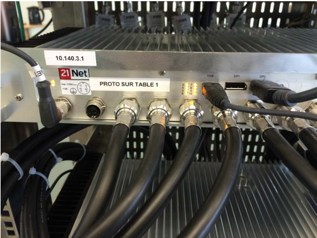
Figure 3 Focus left