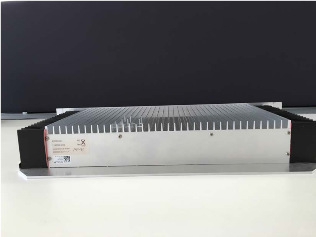
Figure 7 Disassembled, rear view