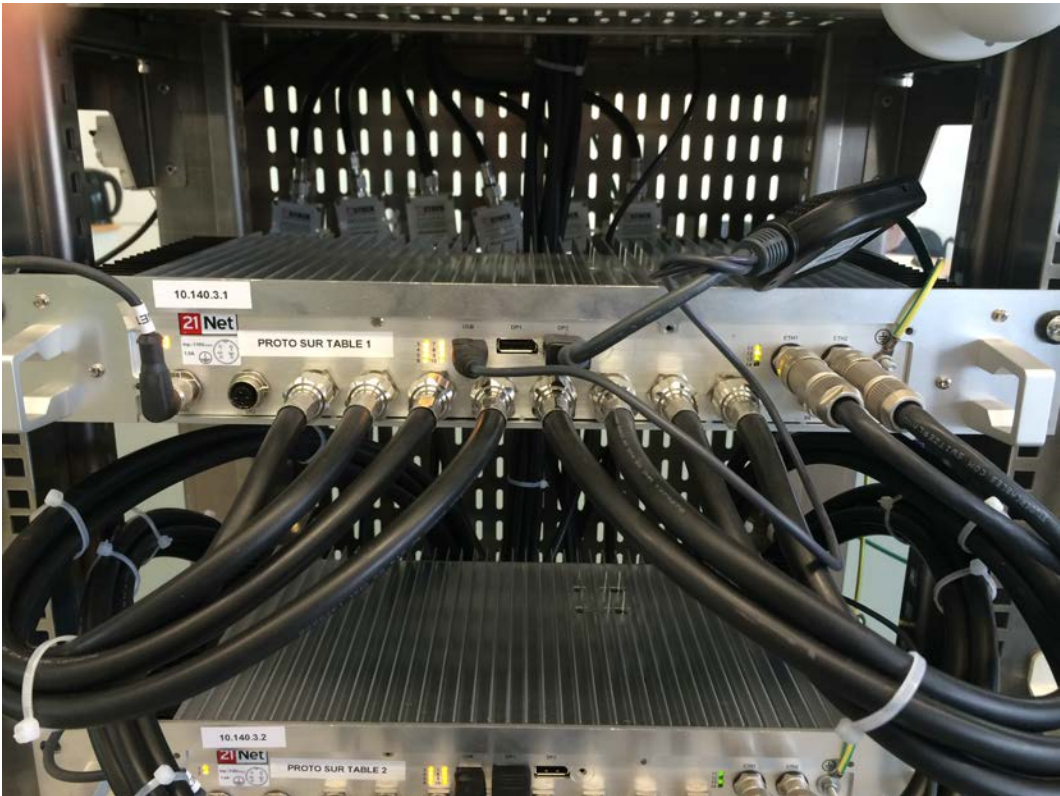
Figure 2 In operation, other angle