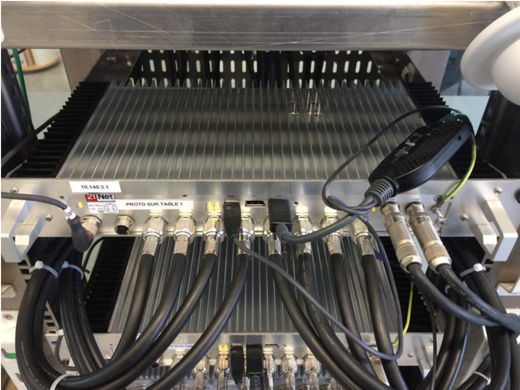
Figure 1 21NetBox in operation