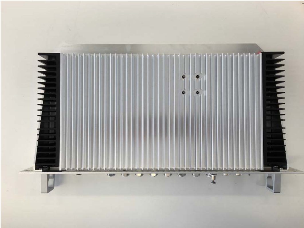
Figure 5 Disassembled for enclosure’s dimensions