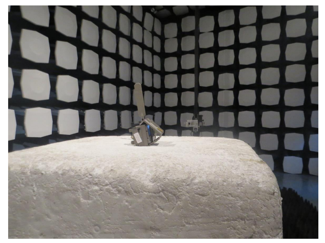
18GHz - 26.5GHz