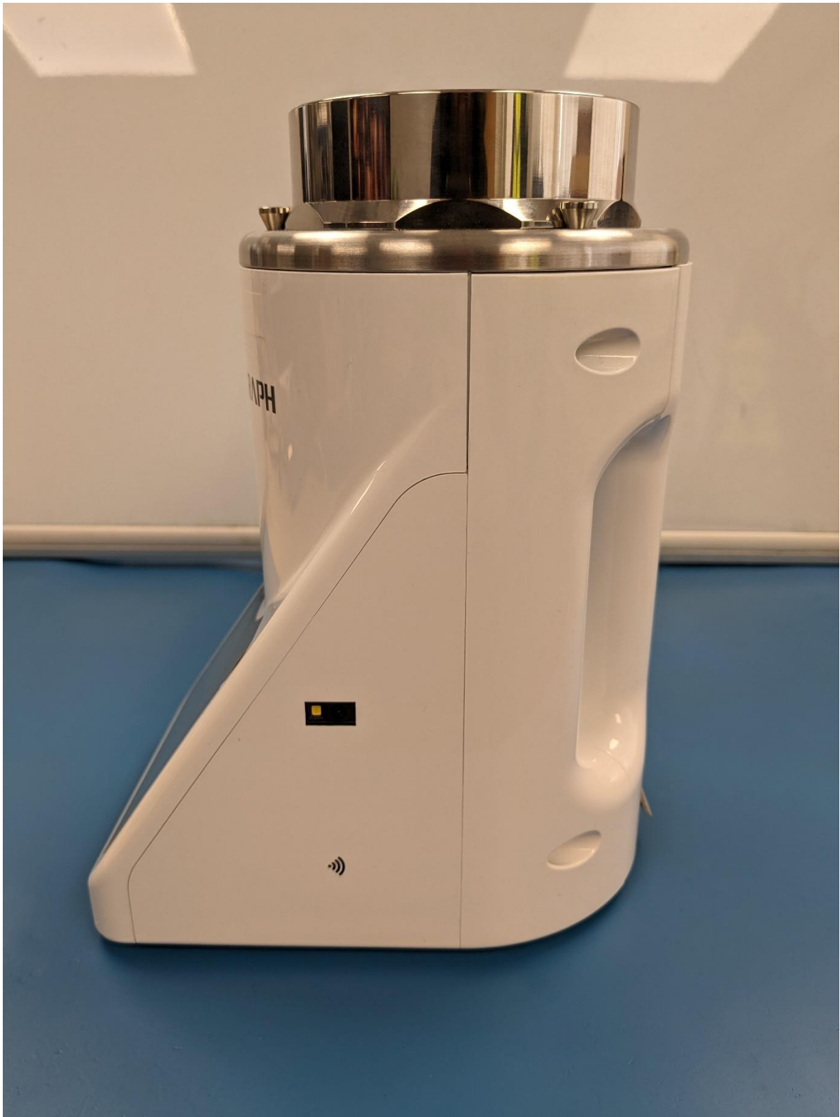
Figure 5: Right hand side, showing barcode scanner, and side RFID antenna location