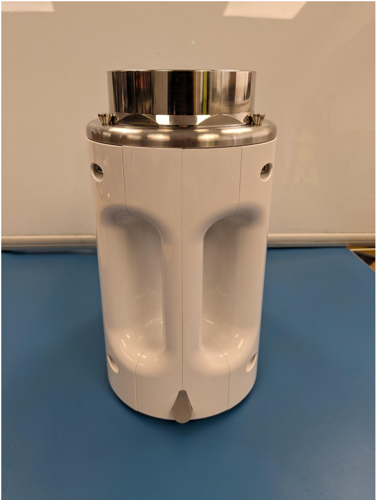
Figure 2: Back view