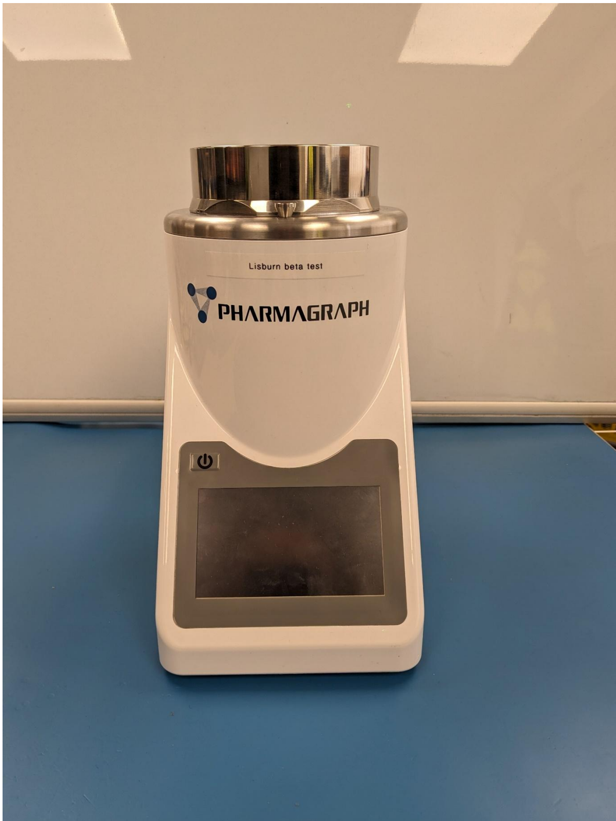
Figure 1: Front view