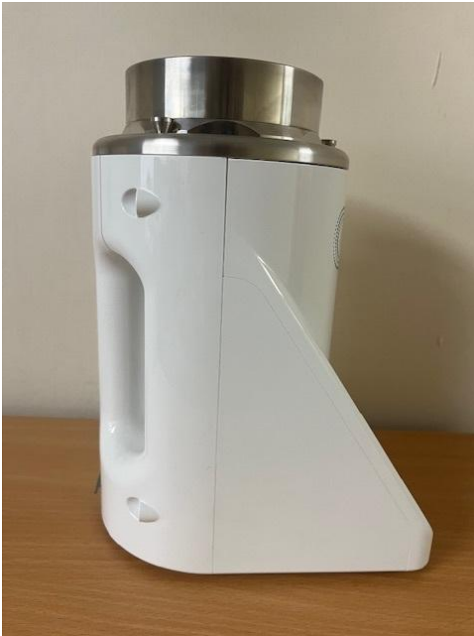
Figure 6: Left Hand Side