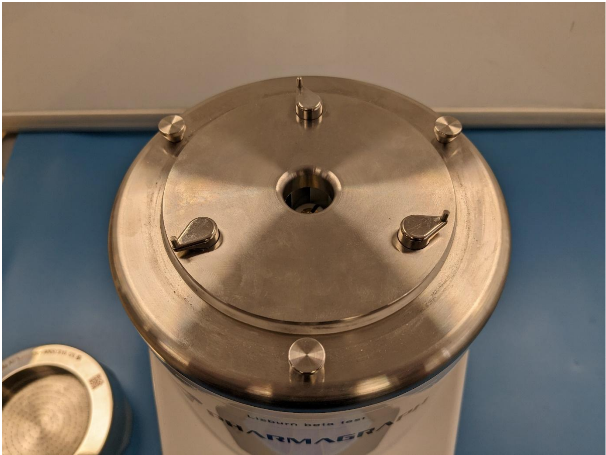
Figure 9: Top view, with sieve head removed