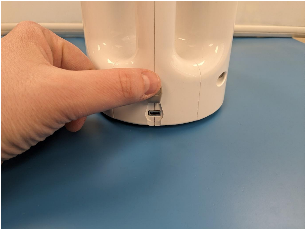
Figure 3: USB Type C Connector