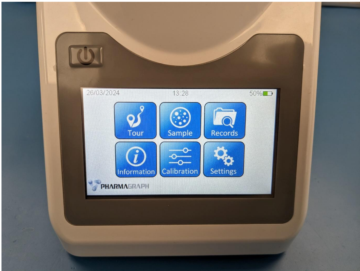
Figure 7: Front, showing touch display and power button