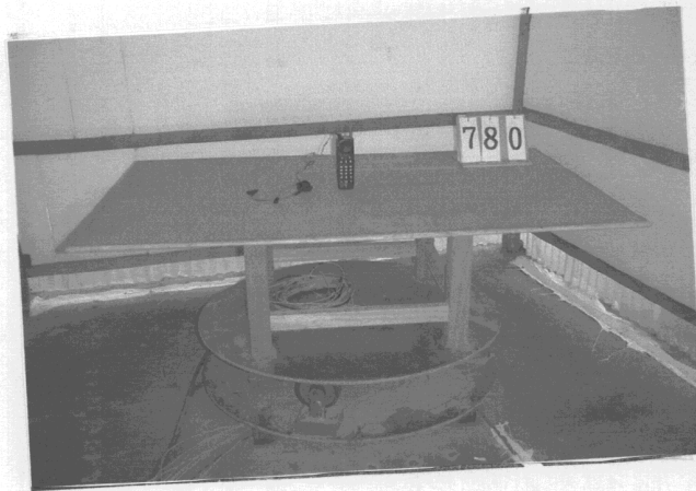
Pic 1 Front View of the Test Configuration (HANDSET)