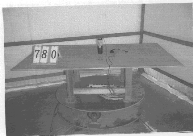
Pic 2 Rear View of the Test Configuration (HANDSET)

The test configuration for frequency between 1 GHz to 18 GHz is same as above.