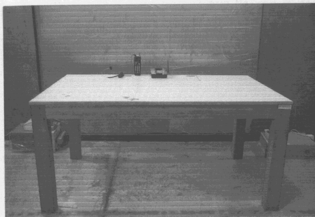
Fig. 2 Conducted Emissions Test Configuration (Operating only)