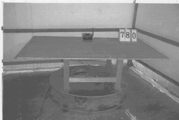
Pic 1 Front View of the Test Configuration ( BASE )