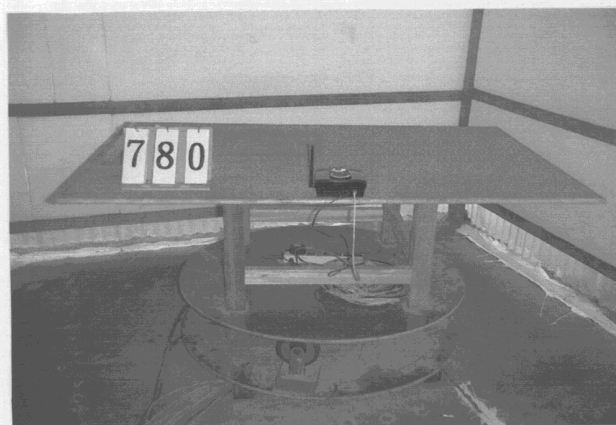
Pic 2 Rear View of the Test Configuration ( BASE )