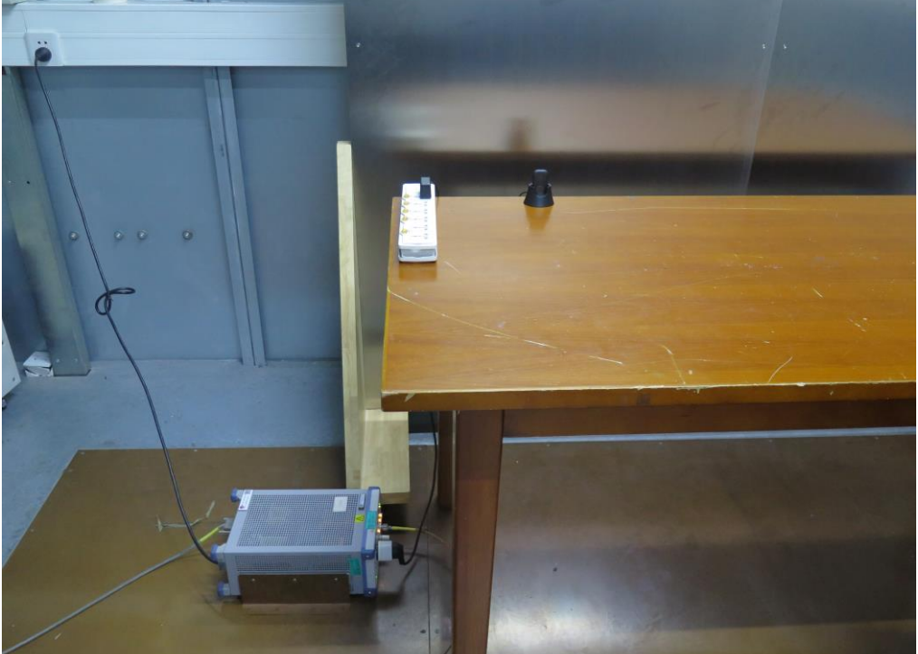
Pic2. Conducted (150KHz-30MHz)