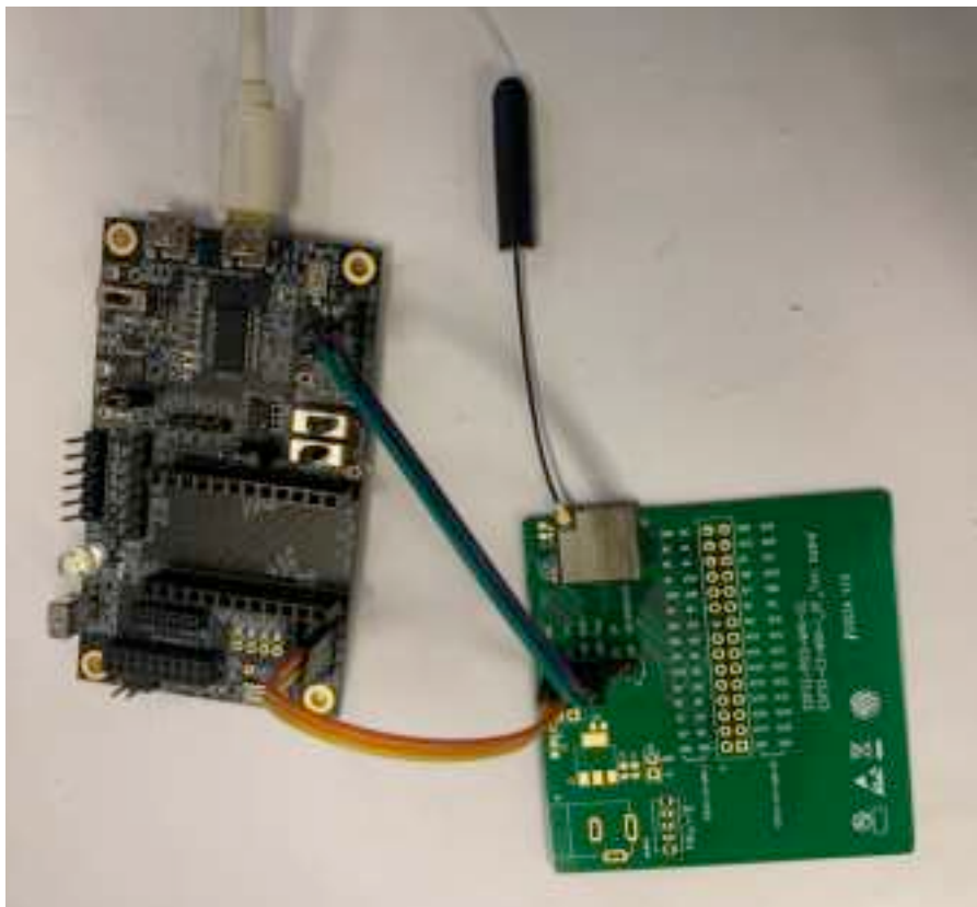
Figure 2: Hardware Connection