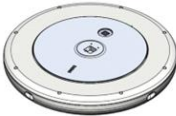
Figure 1: Sensor indicating RJ45 Ethernet Connector

Control: The sensor control is performed via computer network to sensor. Control software written by Radar.