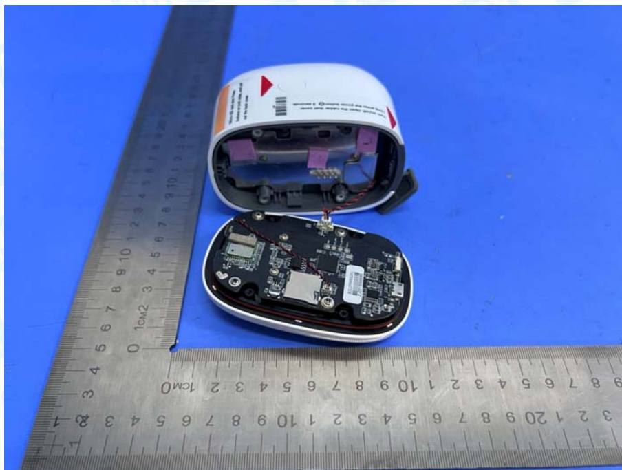
Photo 6 Internal of PCB