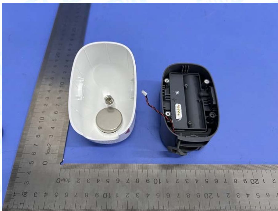
Photo 10 Appearance of Battery