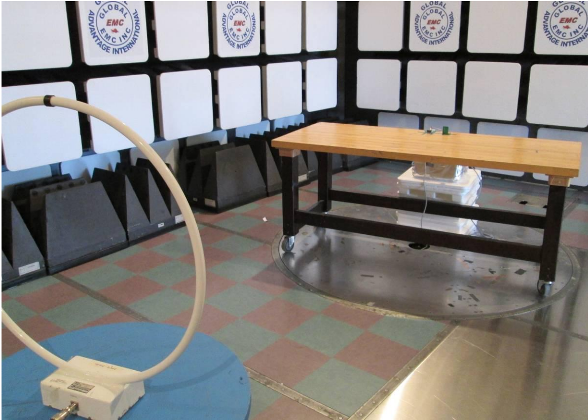
Radiated Emissions – 9 kHz – 30 MHz