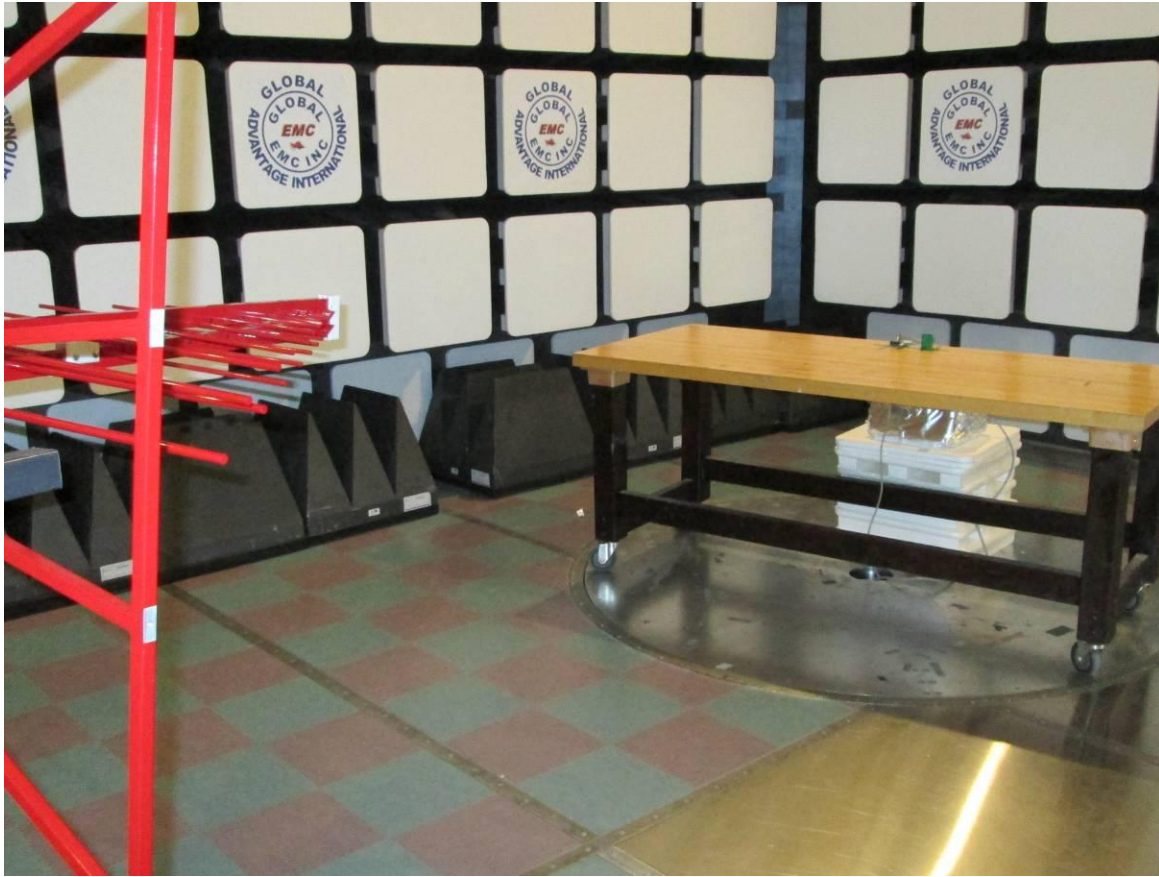
Radiated Emissions – 30 MHz – 1 GHz