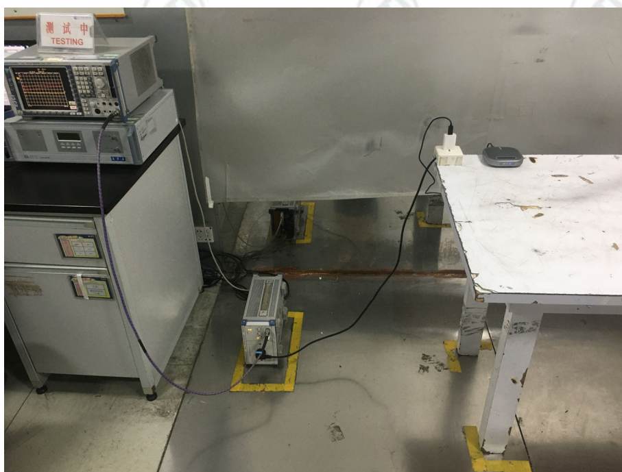
Radiated spurious emission Test Setup-2(CE)