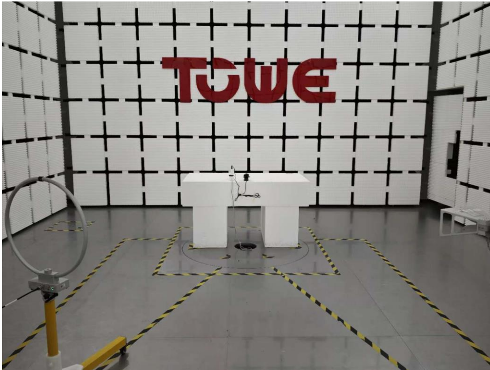
Radiated Spurious Emissions (9kHz to 30MHz)