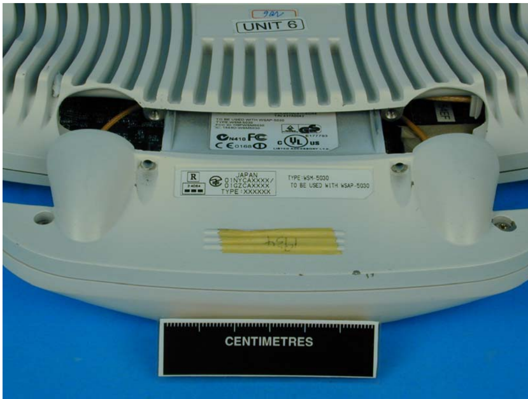
Photo 4: WSM5030 2.4GHz Integral Antenna Outside Case Rear Showing Connection to WSAP5030