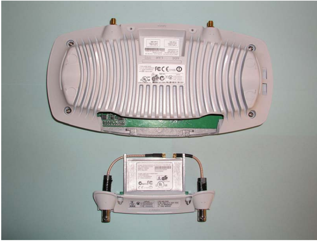
Photo 2; WSAP5030 External Antenna connections 2.4GHz module un-iinstalled