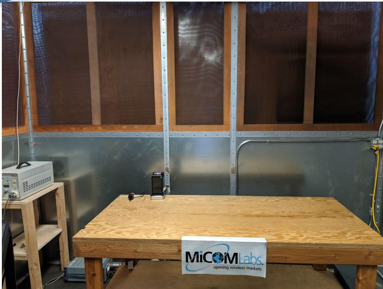
Conducted AC Wireline Front