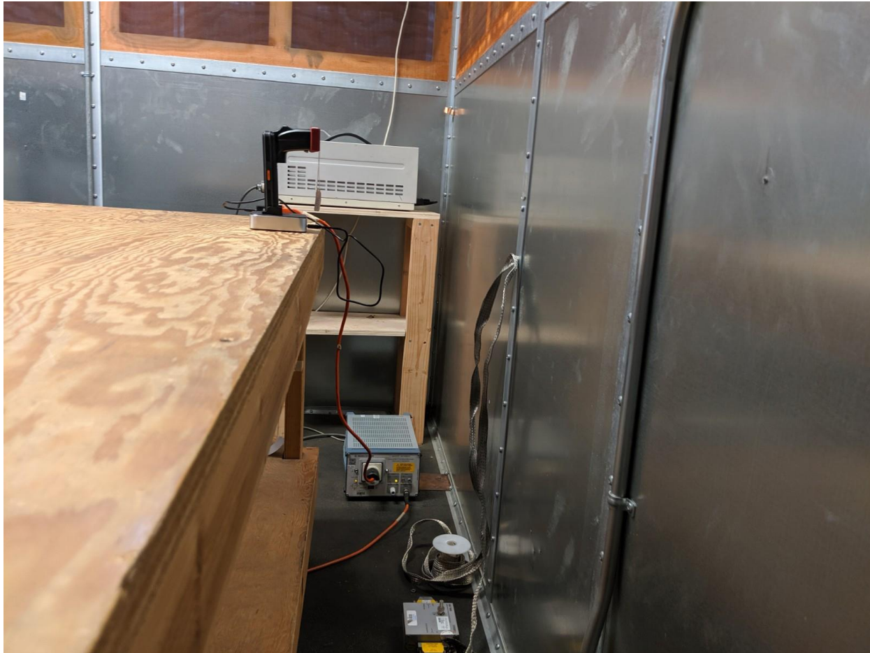
Conducted AC Wireline Back