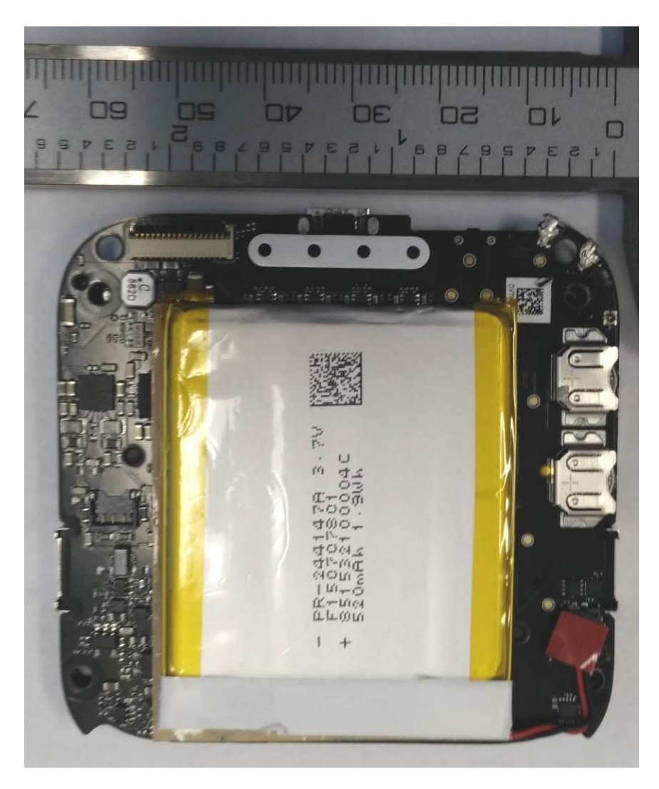
EUT – Internal view 5 PCB, side 2, with battery in place