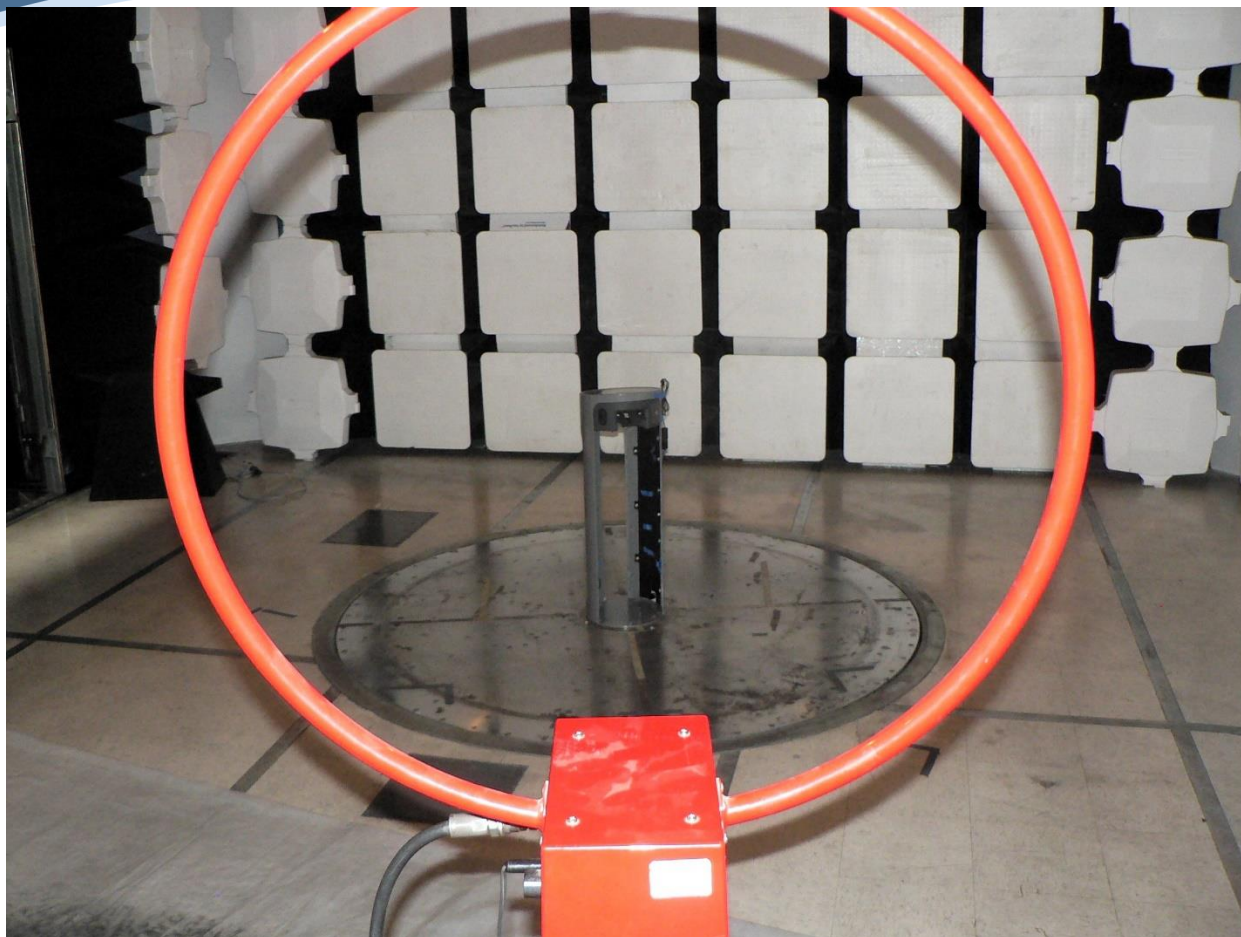
LYFT18 NFC 9kHz-30MHz