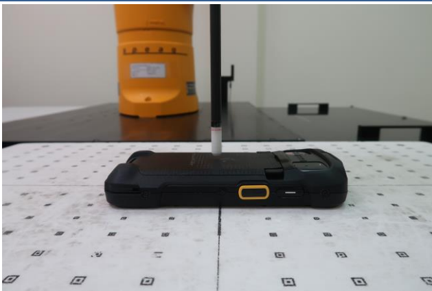
Back at 2 mm