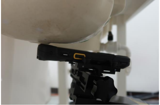
Right Tilted at 0mm