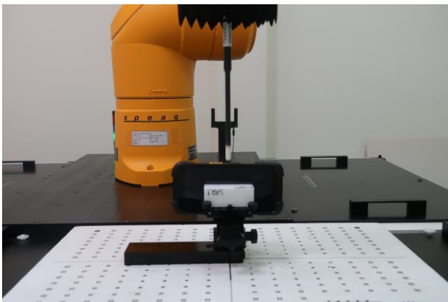
Right Side at 2 mm