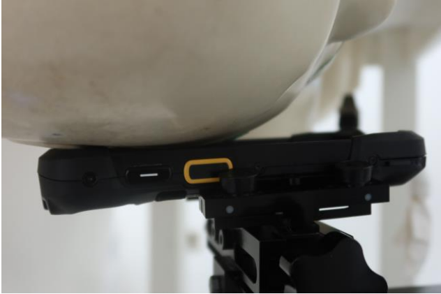
Right Cheek at 0mm