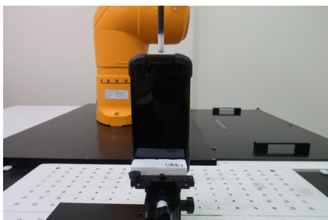
Top Side at 2 mm