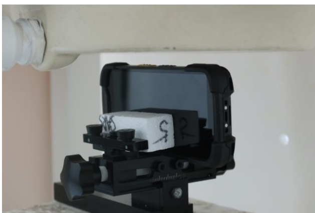
Left Side at 10 mm