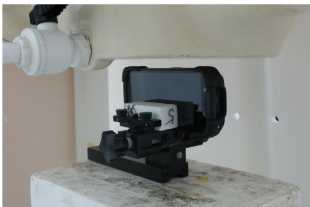
Right Side at 10 mm