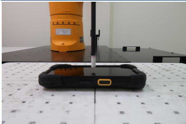
Front at 2 mm