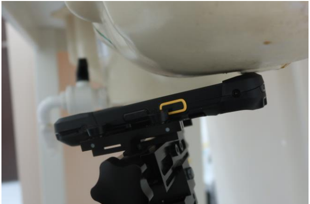
Left Tilted at 0mm