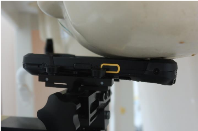
Left Cheek at 0mm