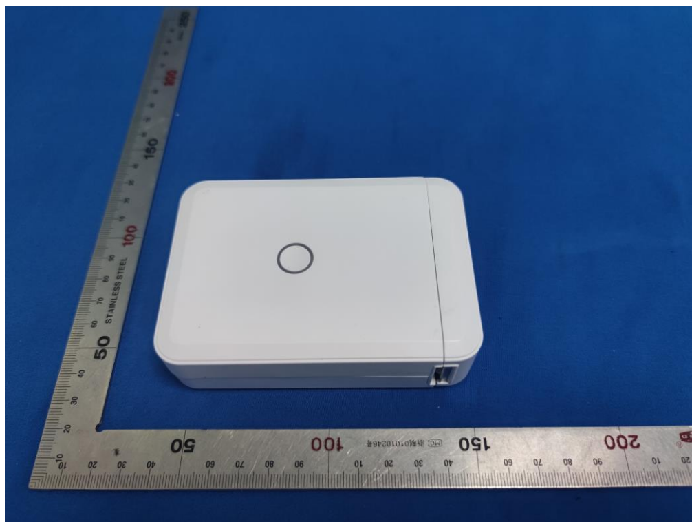
PORT VIEW OF EUT