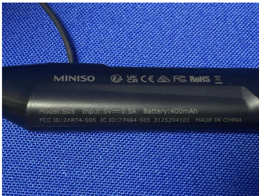
View of Product-10