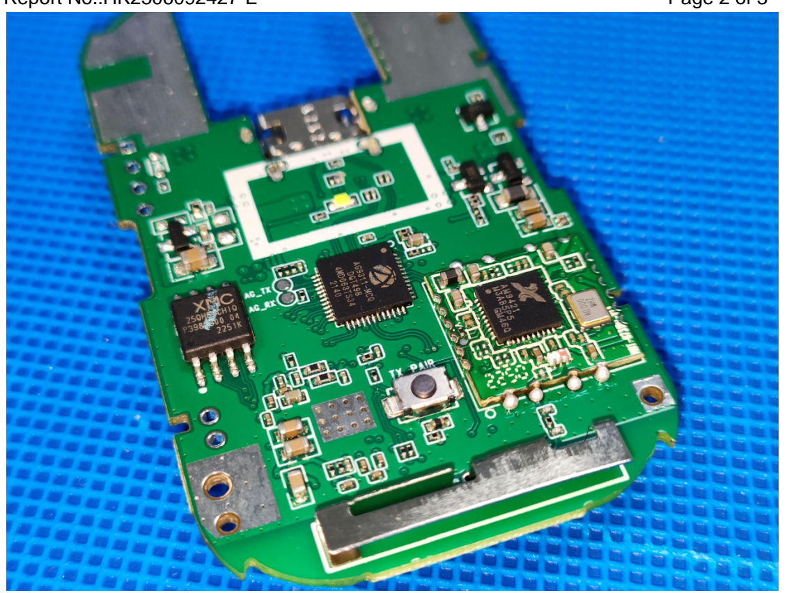
Page 2 of 3