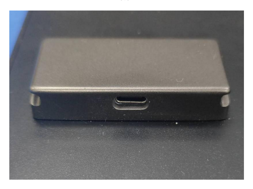
USB-C to USB-C cable Photo 12