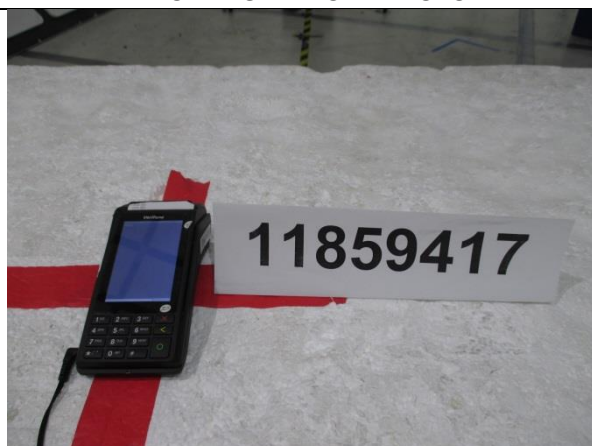
X-AXIS FRONT PHOTO