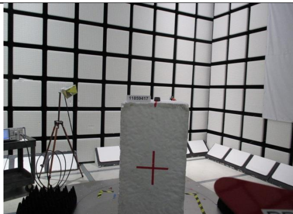
ABOVE 1GHz FRONT PHOTO