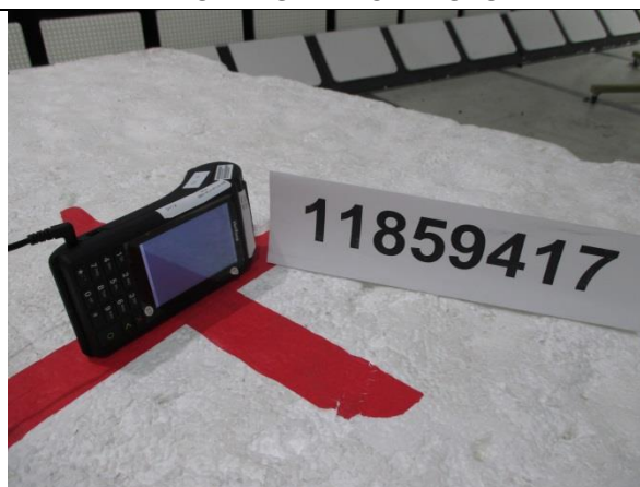
Y-AXIS FRONT PHOTO