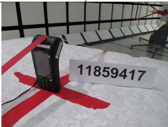
Z-AXIS FRONT PHOTO