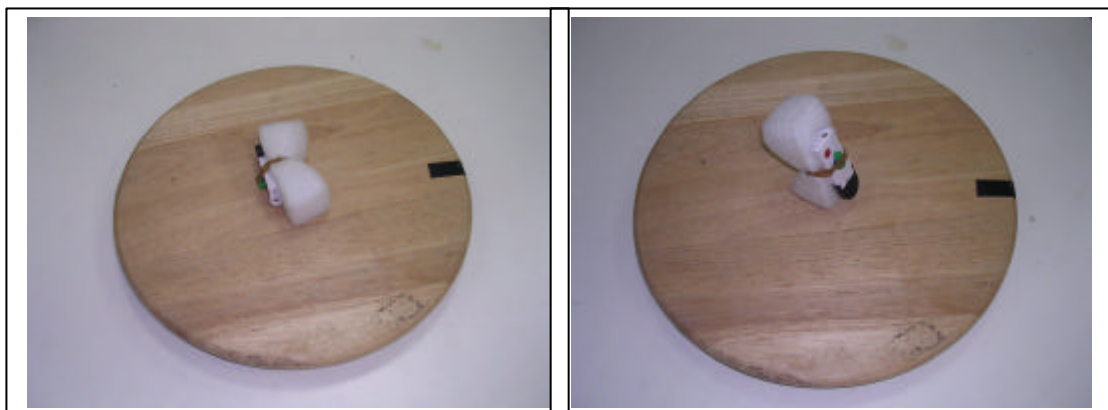
Radiated Open Site Test Set-up