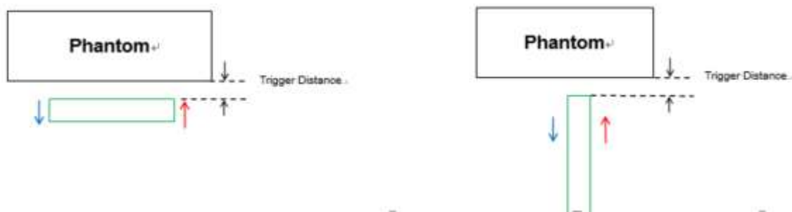
Proximity Sensor Trigger Distance Assessment KDB 616217 D04§6.2

For detailed measurement conducted power results, please refer to the Section .11