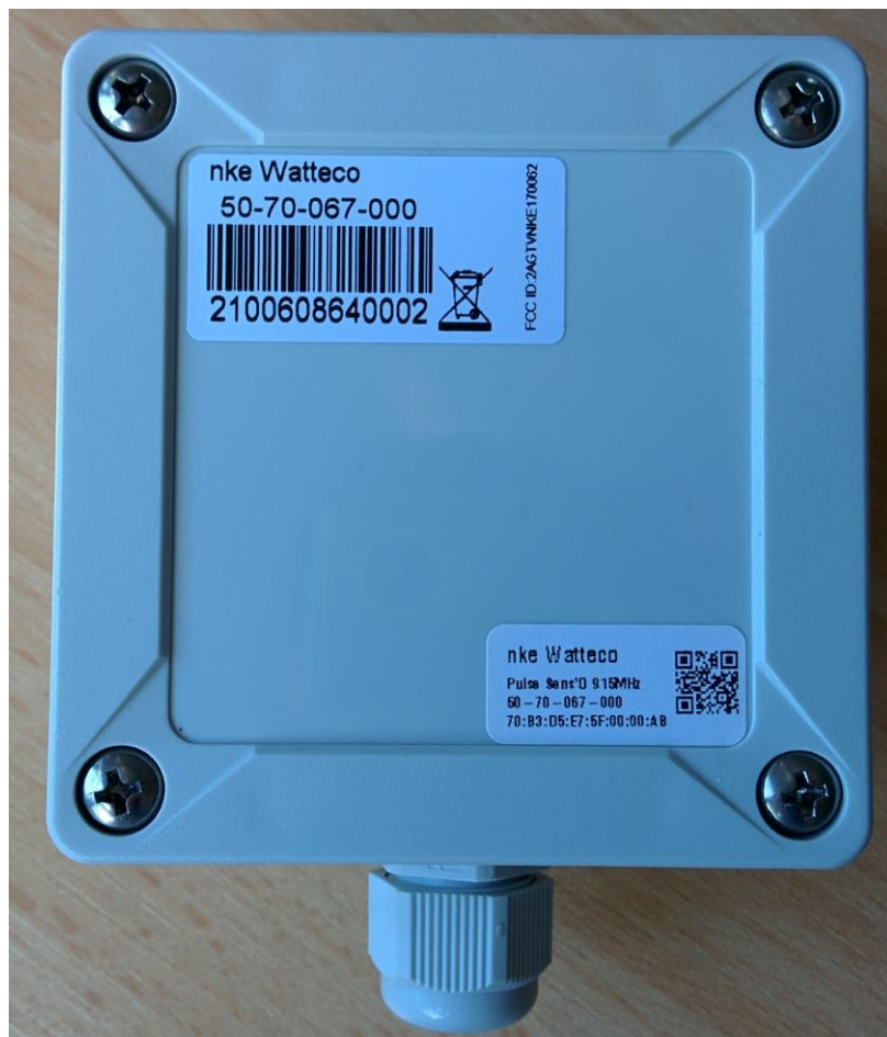
FIGURE 2 - FCC LABEL LOCATION

This label is put on the front of the device, on the casing as it can be seen on the illustration here below.