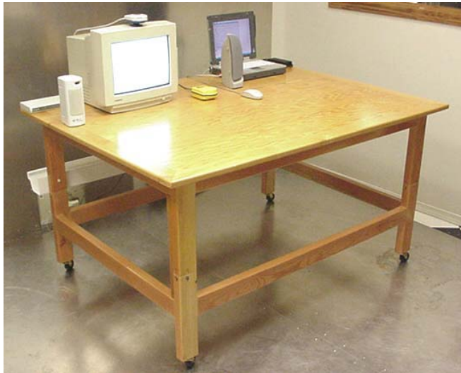
Photograph G-1 – AC Powerline Conducted Emission Configuration