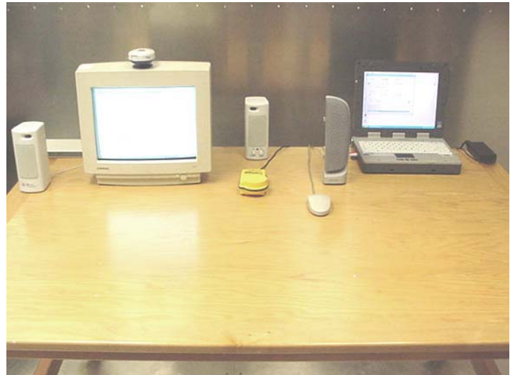
Photograph G-2 – AC Powerline Conducted Emission Cable Placement