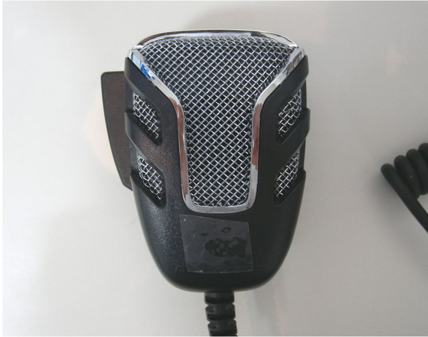
MICROPHONE REAR VIEW