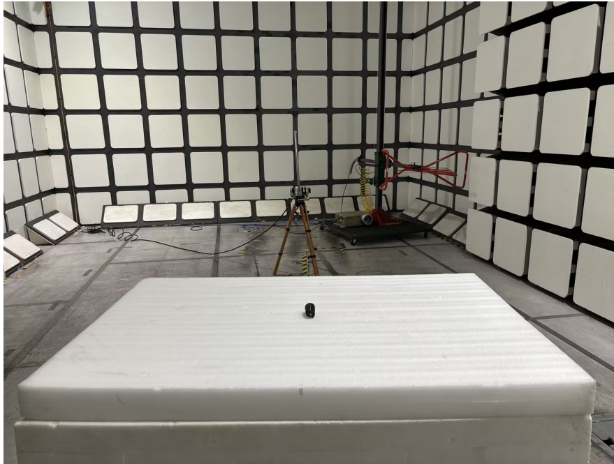
Radiated Emissions View (9 kHz-30 MHz)- Parallel