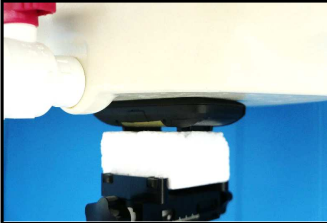
Front Face of EUT Tested at 0 mm