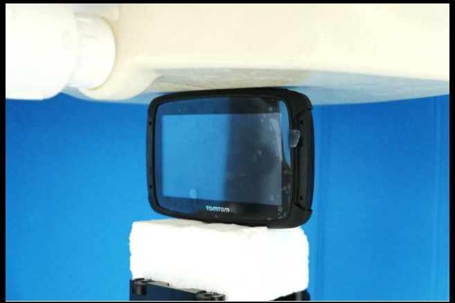
Top Side of EUT Tested at 0 mm