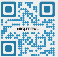
Option 2a Setup Video

NOTE: Our WNIP8 Series cameras cannot be added to our BTD2 Series DVRs.