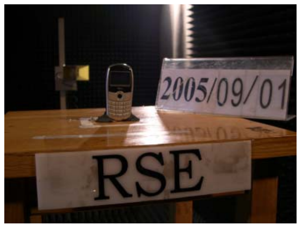
Pic2 Radiated Spurious Emission ***END OF REPORT BODY***