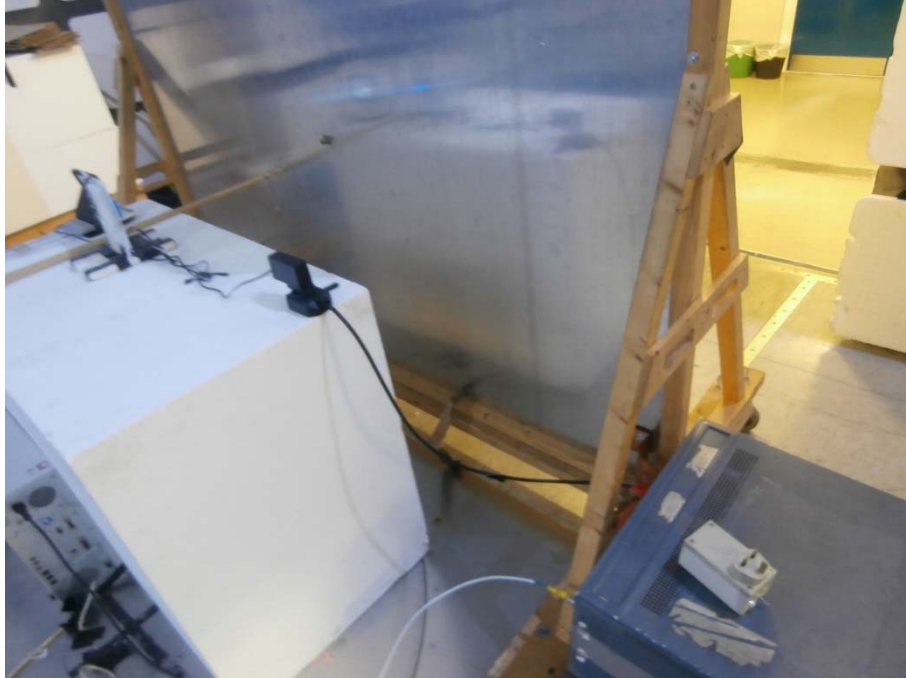
Conducted Emissions 150 kHz to 30 MHz