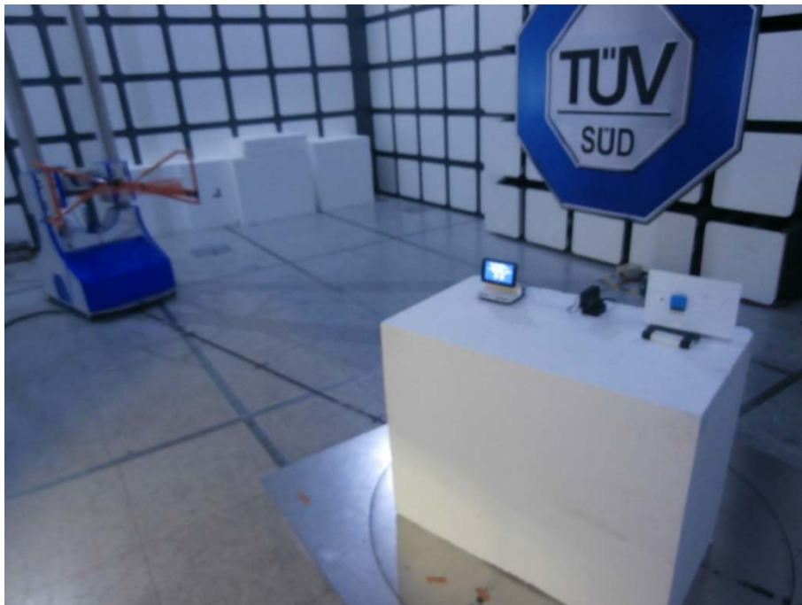
Radiated Emissions 30 MHz to 1 GHz