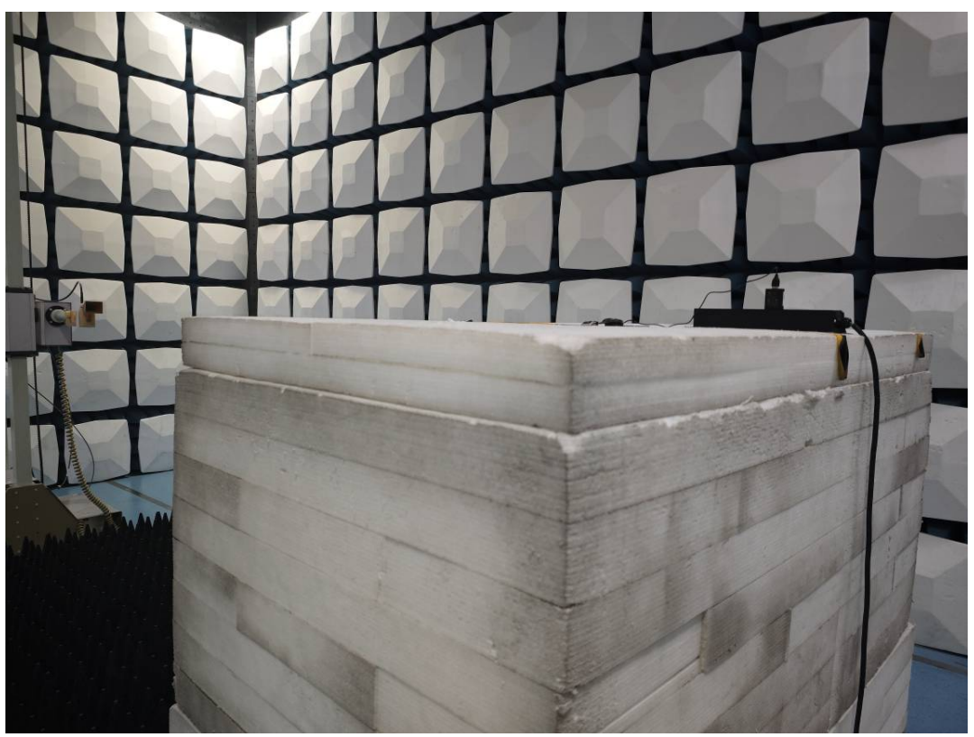
Radiated Emission 18-25GHz View