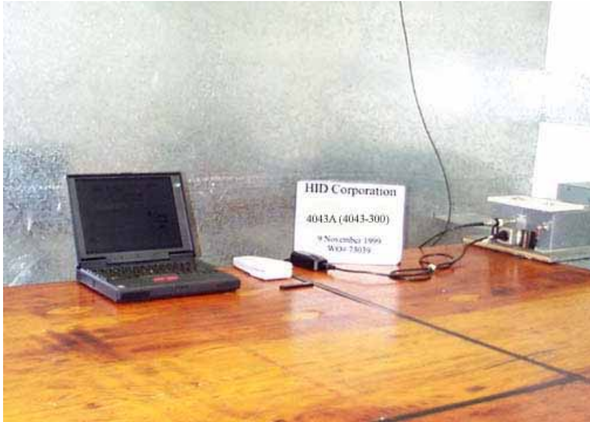
Conducted Emissions - Front View