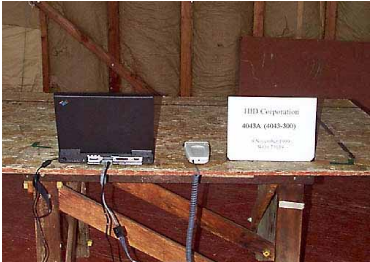
Radiated Emissions - Back View