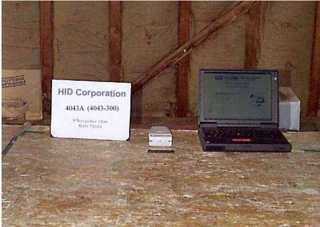
Radiated Emissions - Front View