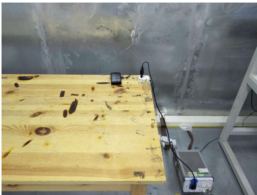
AC Conducted Emission of charge from power adapter mode