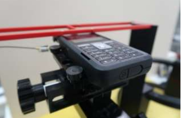
Left Side View Left Side View