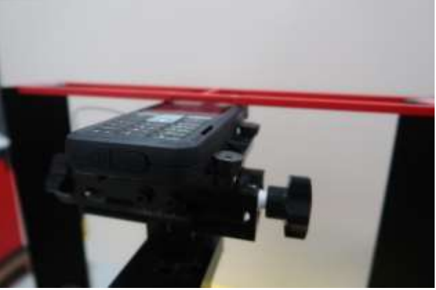
Right Side View Right Side View

TEL: 886-3-327-3456 Page D1 of D1 FAX: 886-3-328-4978 Issued Date: Mar. 07, 2022