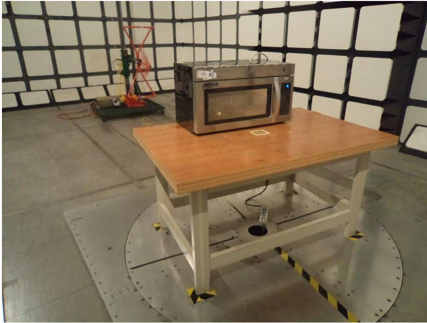
Radiated Emissions - Rear View (30 MHz – 1 GHz)