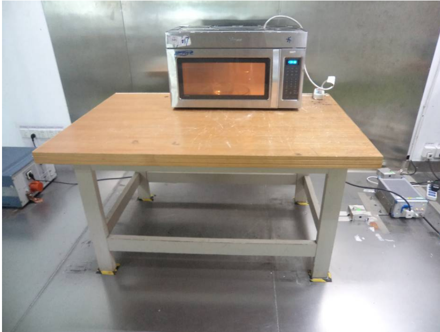
Conduction Emissions - Side View