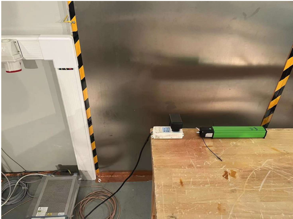
Test Set-up: Conducted emission 150KHz-30MHz