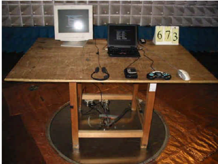
Front View of the Test Configuration