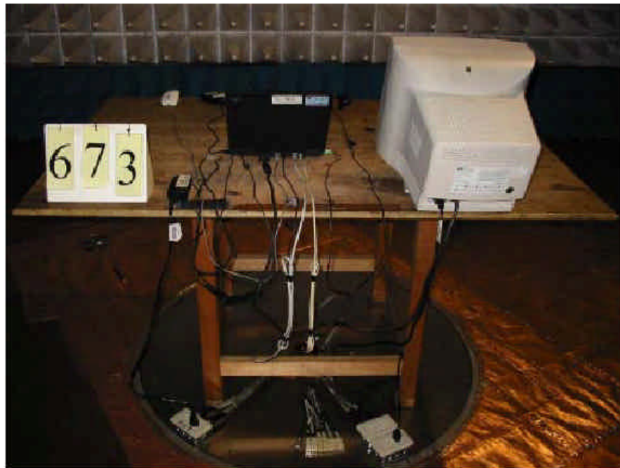
Rear View of the Test Configuration

The test configuration for frequency between 1GHz to 25GHz is same as above.