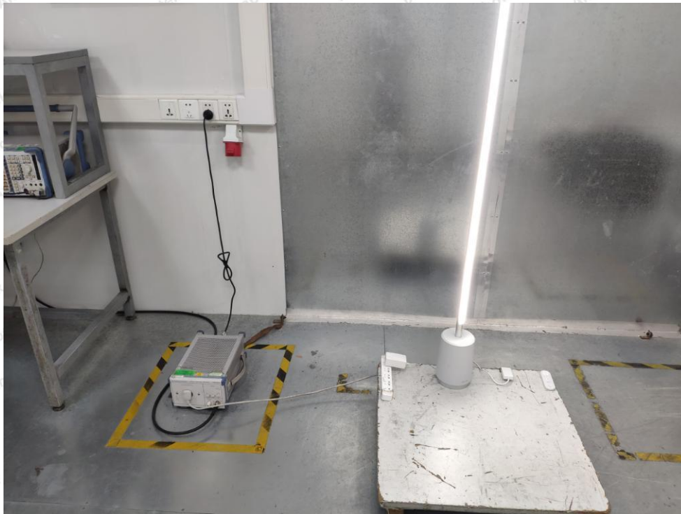
Photo of Radiation Emission Test