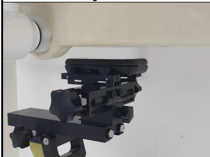
Front Face of EUT with 1.5 cm Gap