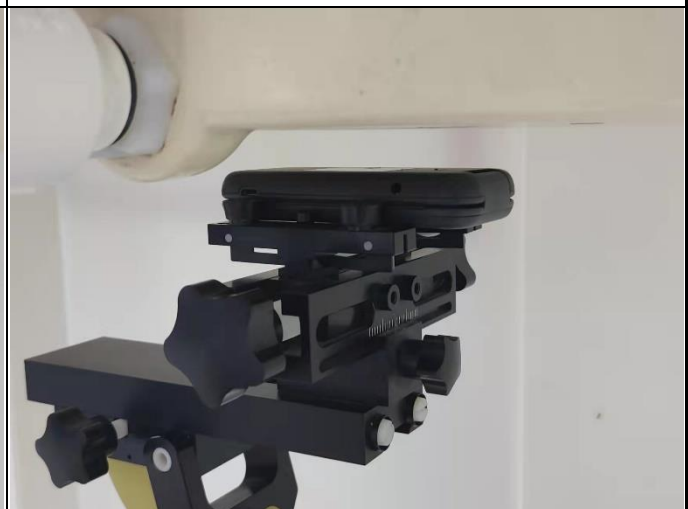
Rear Face of EUT with 1.5 cm Gap