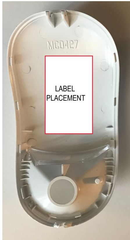
Label location - Enclosure inside cover

www - Manufacturing week and year (variable)