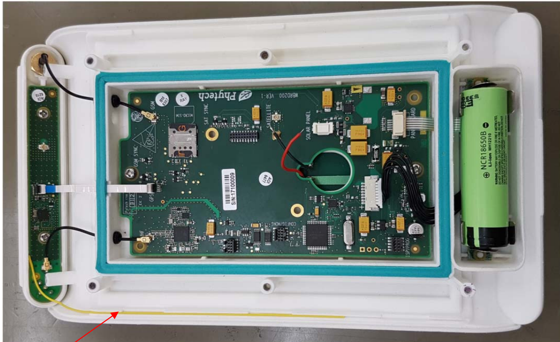
Photograph No.1 Logger internal view