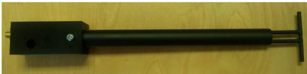
Figure 1 – MVG COMOSAR Validation Dipole

MVG's COMOSAR Validation Dipoles are built in accordance to the IEC/IEEE 62209-1528 and FCC KDB865664 D01 standards. The product is designed for use with the COMOSAR test bench only.