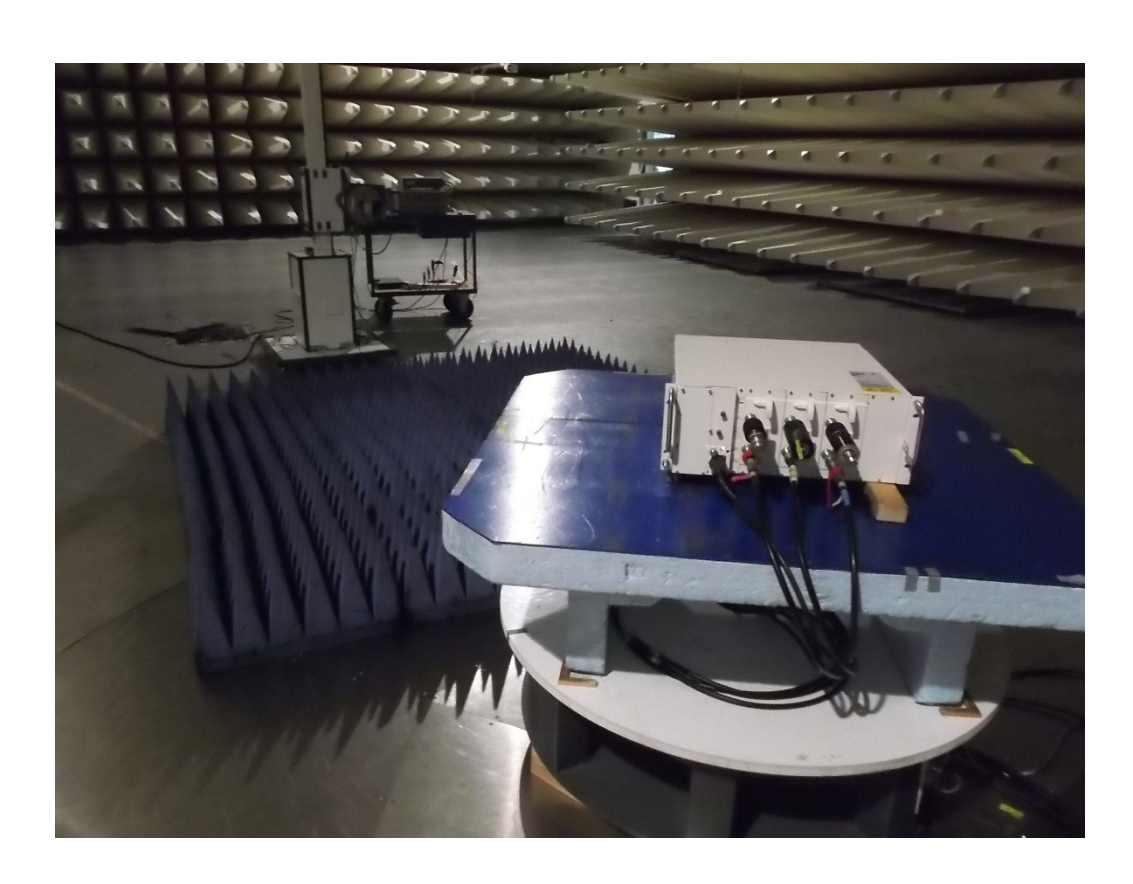
Test setup: Field Strength Emission 1 - 18 GHz @3m in the SAC