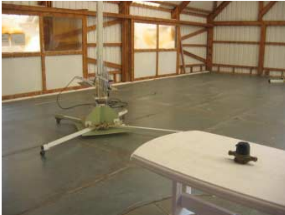
Photograph No.1 Setup for carrier field strength measurements at the OATS